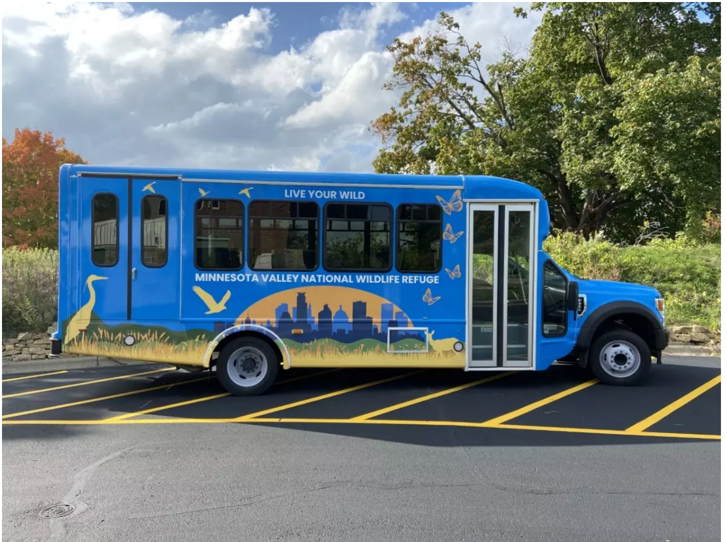
Logan created the art featured on this Minnesota Valley National Wildlife Refuge shuttle bus. Logan Sauer/USFWS | Image Details